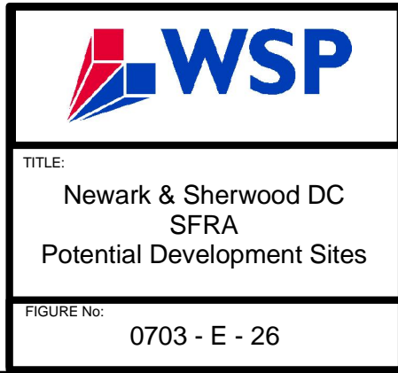
38. Land off Farnsfield Road, Bilsthorpe