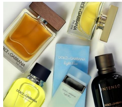
perfume bottles & aftershave bottles (no lids)