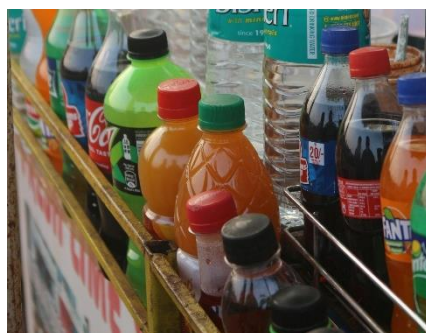
plastic drink bottles (keep lids on & squash)