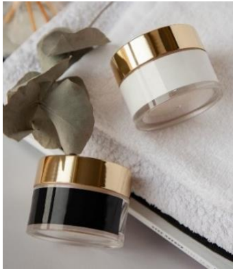
glass toiletry jars (no lids)