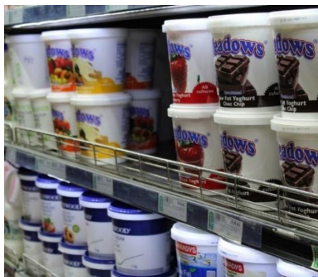
yoghurt pots (no lids)