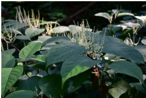
invasive plants (such as Japanese knotweed)