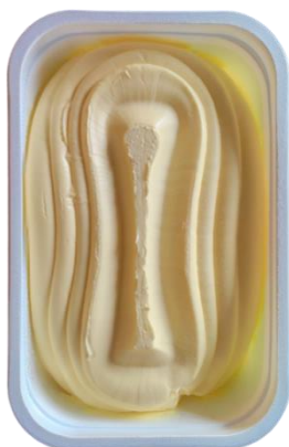
margarine tubs (no lids)