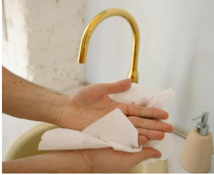
paper towels & wet wipes