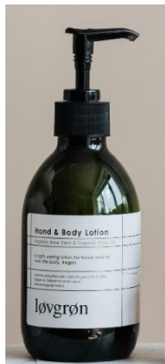
glass toiletry bottles (no dispensing pumps)