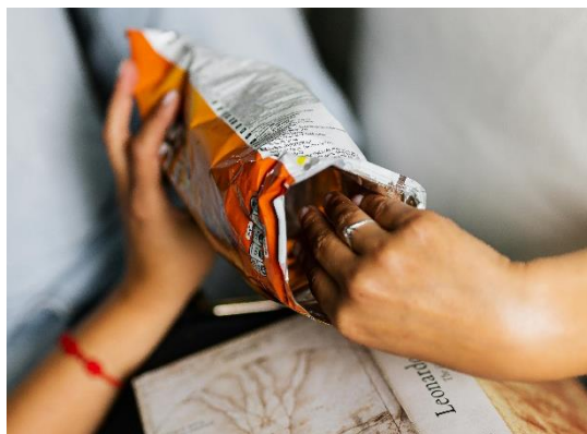
packets & wrappers