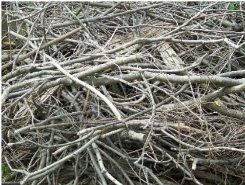
small branches & twigs