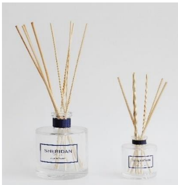
reed diffuser bottles (no reeds)