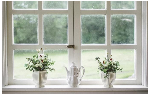
panes of window glass