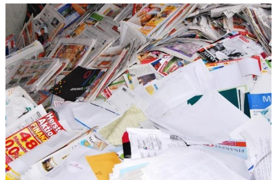
envelopes & junk mail