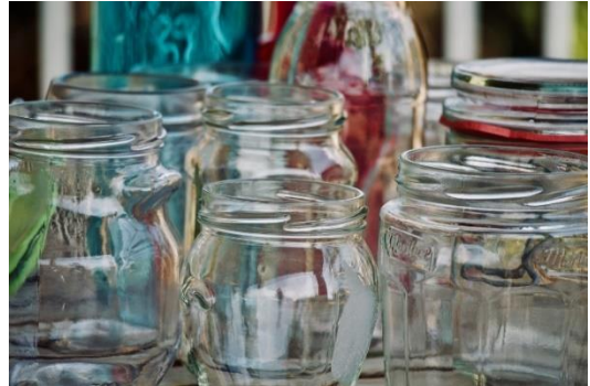
glass food jars (no lids)