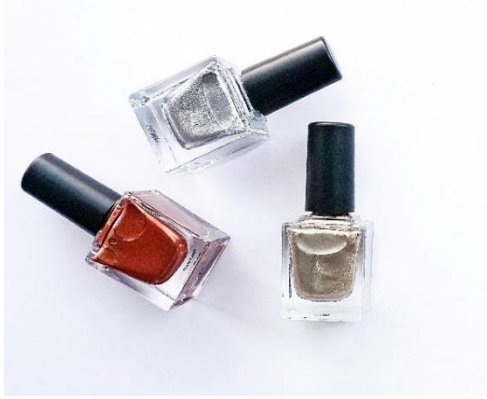
nail varnish bottles