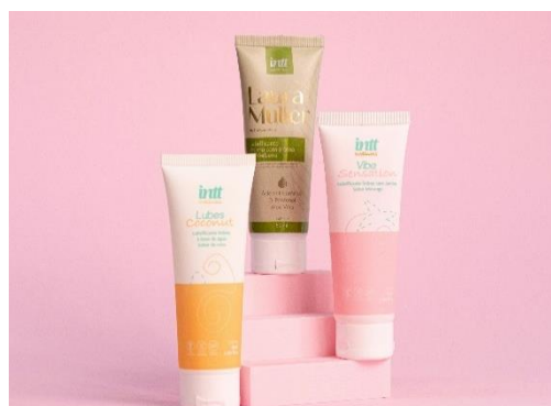
plastic tubes & lids