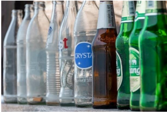
glass drink, oil & sauce bottles