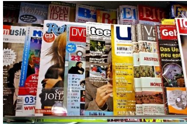
newspapers & magazines