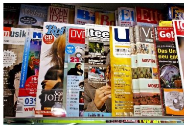
newspapers & magazines