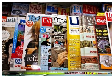
newspapers & magazines