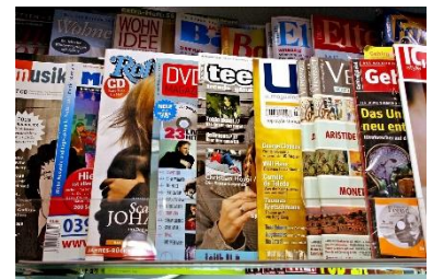
newspapers & magazines