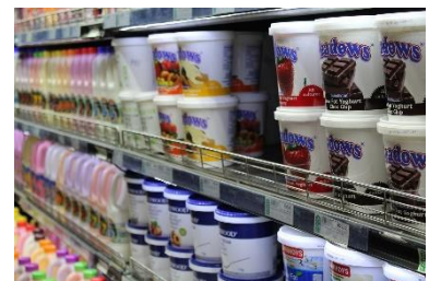
plastic yoghurt pots