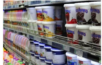
plastic yoghurt pots