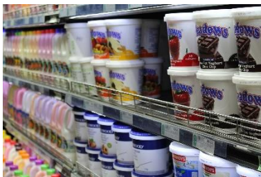
plastic yoghurt pots