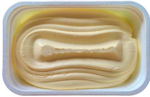
plastic margarine tubs

Shout 'BINGO' when you get all 9 items .