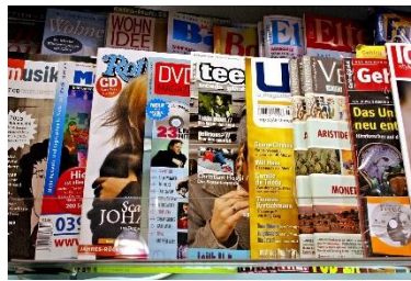
newspapers & magazines