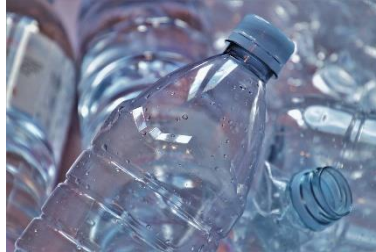
plastic drink bottles