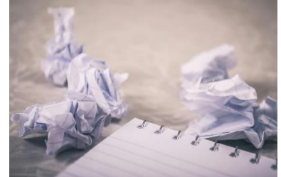
paper & card