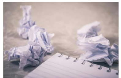
paper & card