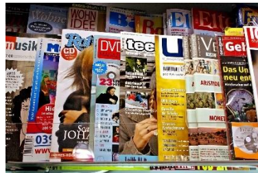
newspapers & magazines