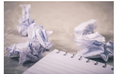
paper & card