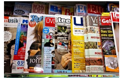
newspapers & magazines