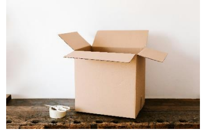
clean cardboard packaging