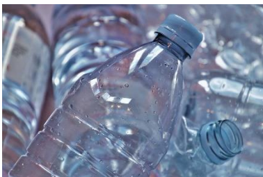
plastic drink bottles