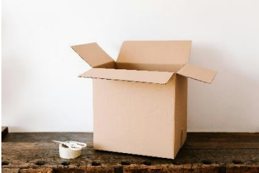
clean cardboard packaging

Shout 'BINGO' when you get all 9 items .