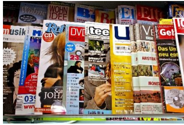
newspapers & magazines