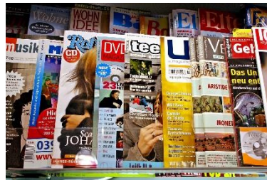
newspapers & magazines