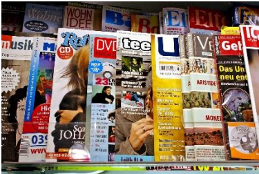
newspapers & magazines

Shout 'BINGO' when you get all 9 items .