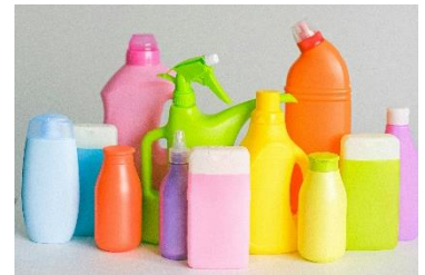
plastic cleaning bottles