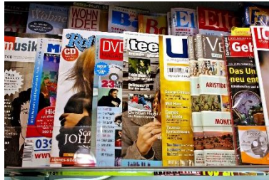
newspapers & magazines