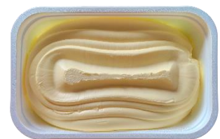
plastic margarine tubs