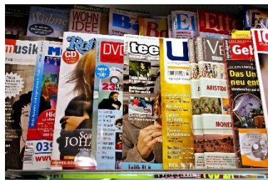
newspapers & magazines