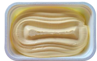
plastic margarine tubs