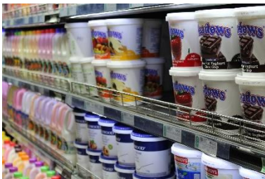
plastic yoghurt pots