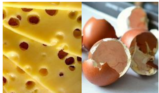
dairy products (no milk)