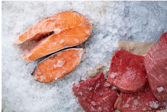
meat & fish