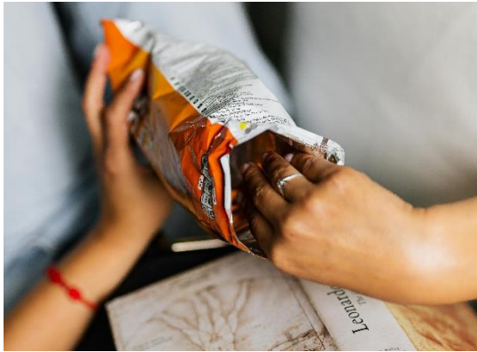
packets & wrappers