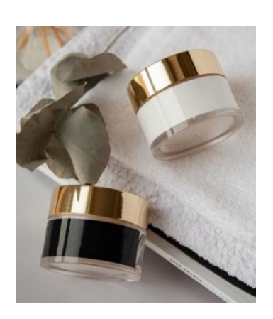
glass toiletry jars (no lids)