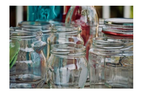
glass food jars (no lids)