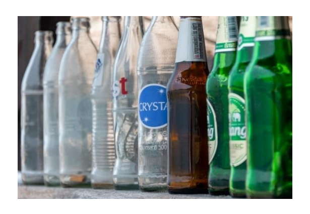
glass drink bottles