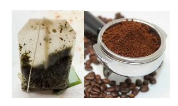
tea & coffee