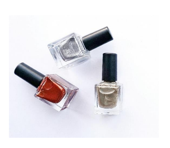
nail varnish bottles