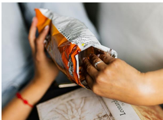
packets & wrappers