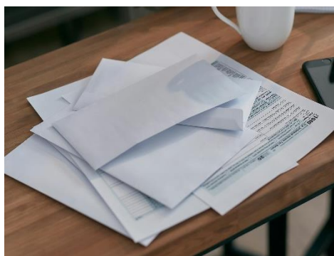
envelopes & junk mail