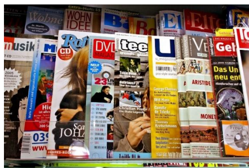
magazines & catalogues