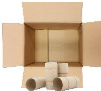
cardboard boxes & tubes (remove tape)